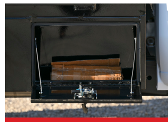
(2) INTEGRATED TOOLBOXES