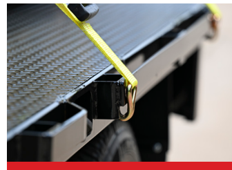
3/8" x 2" SIDE RAILS