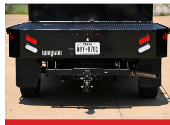
14" TAIL SKIRT W/TAPER