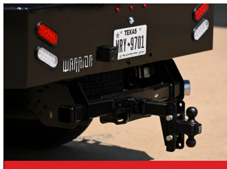
OEM FACTORY HITCH